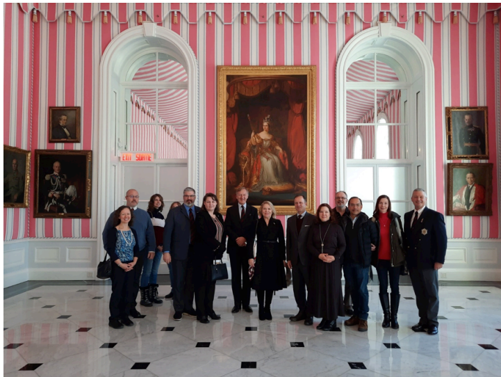
Rideau Hall Tour group poses in the Tent Room