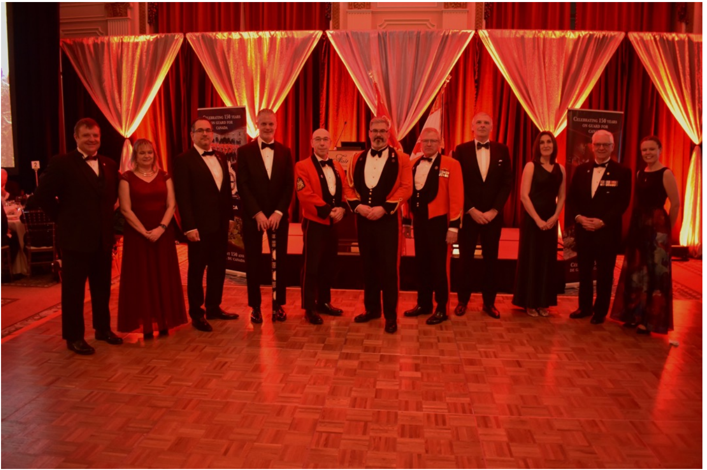
Above: Sponsor representatives pose with the RSM, LCC and HLCol.