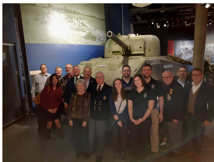
Canadian War Museum Tour group poses in front of "Forceful III"

The tours started in the Memorial Hall with highlighted points of interest stops to educate on Indigenous warfare, the war of 1812-14 which formed our nation, and, dear to our hearts, a stop at our GGFG Sherman tank “Forceful III”, along with a powerful talk on our Regiment’s contribution to the liberation of Europe in World War 2. Several group photos were taken at this point surrounding our tank.